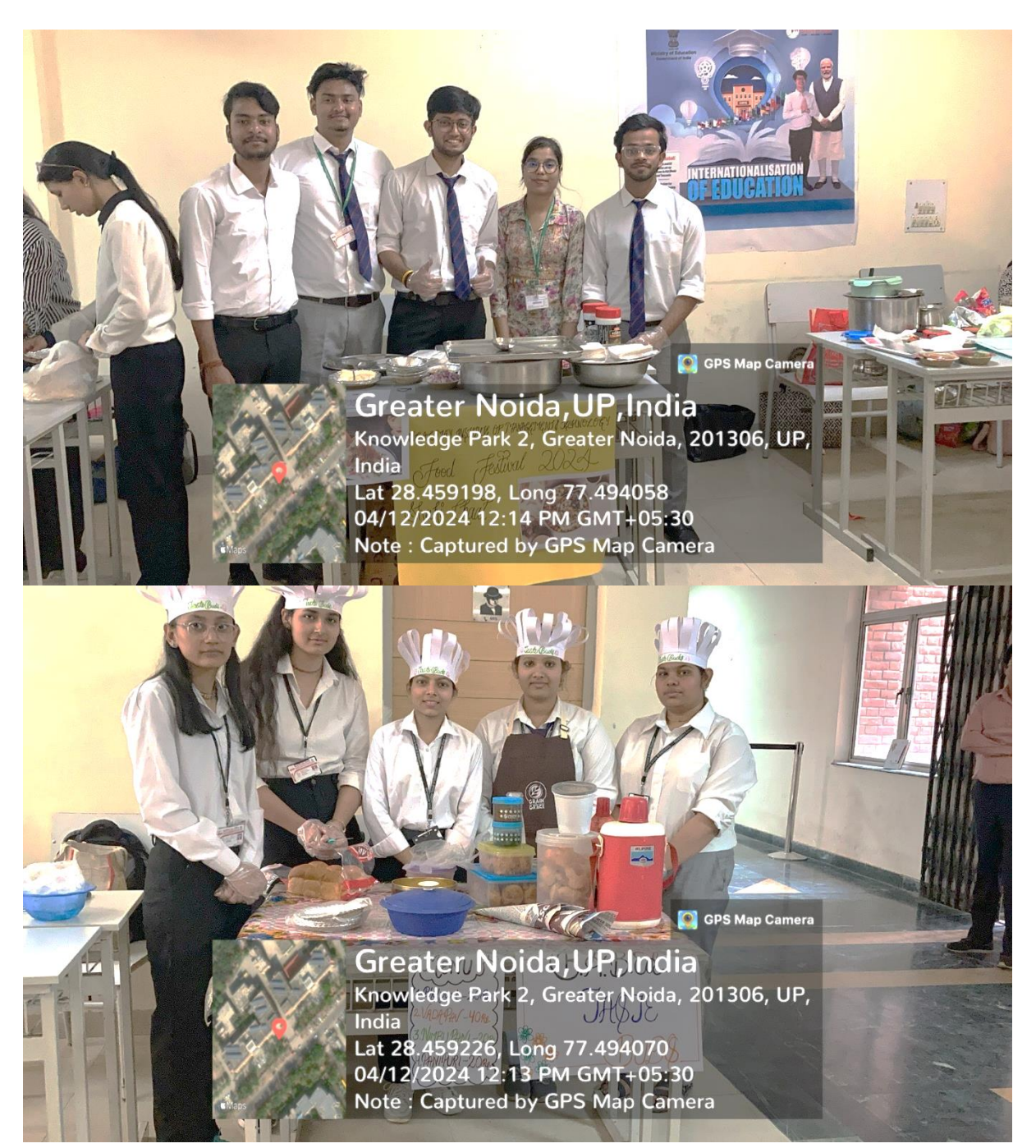
Students showcasing their food items on their respective stalls