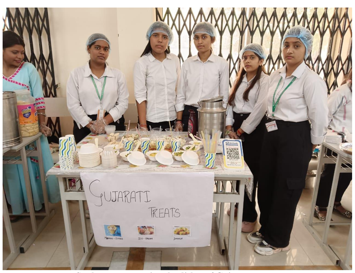
Students representing the dishes of Gujrat