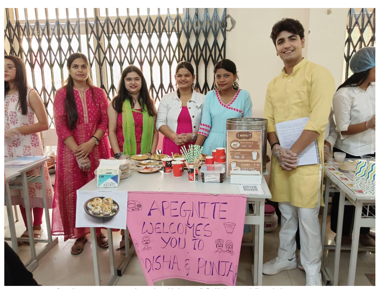
Students representing the dishes of Odisha and Punjab