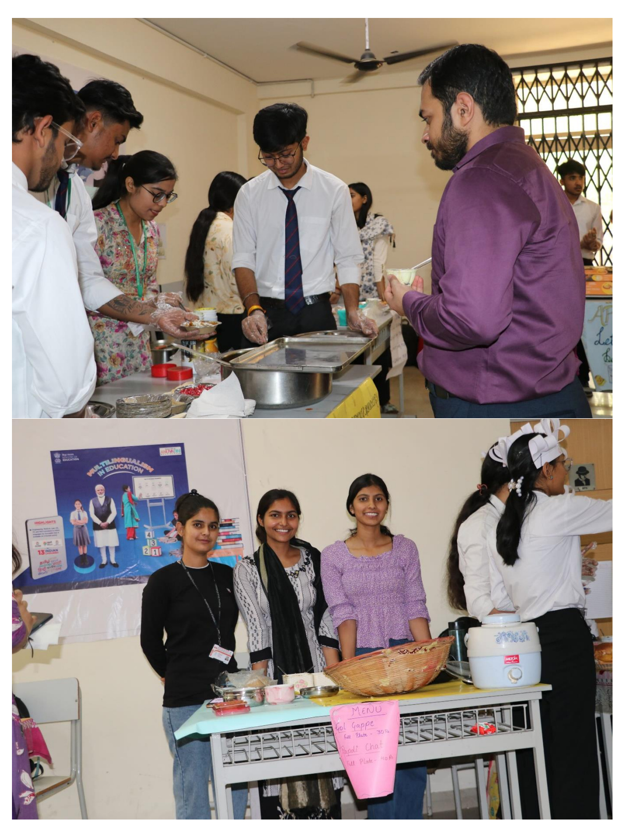
Judges tasting the dishes for evaluation & Students representing their stalls