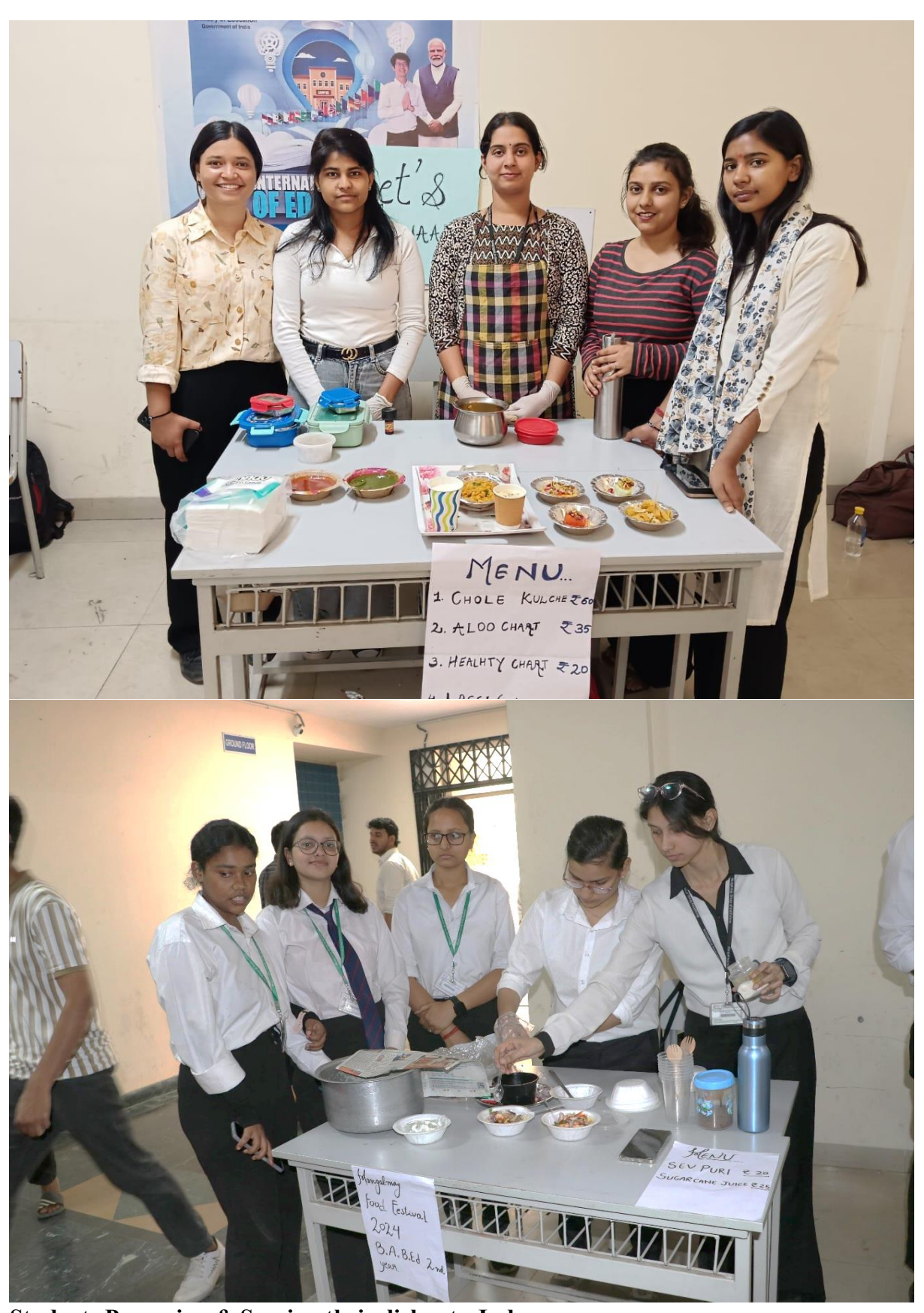
Students Preparing & Serving their dishes to Judges